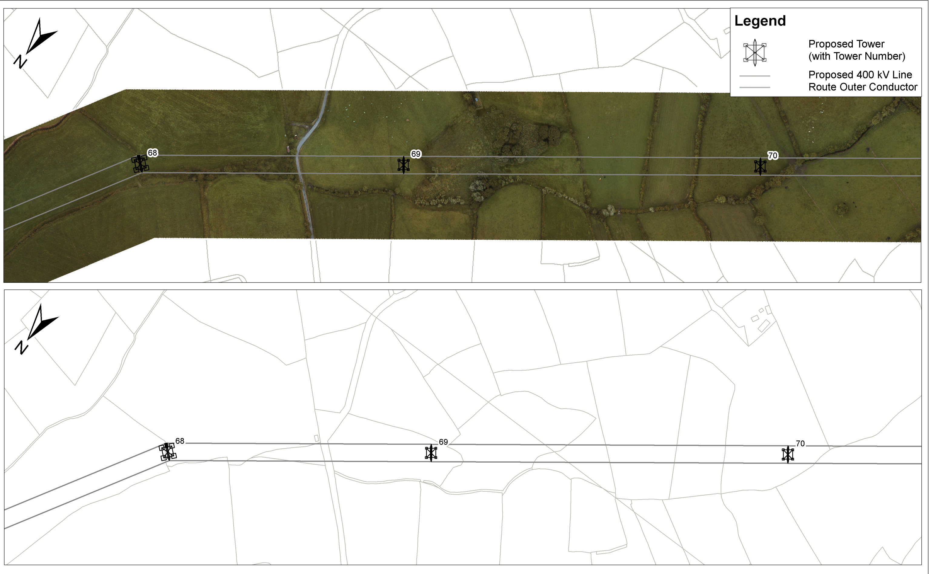
View 2: 1/2,500