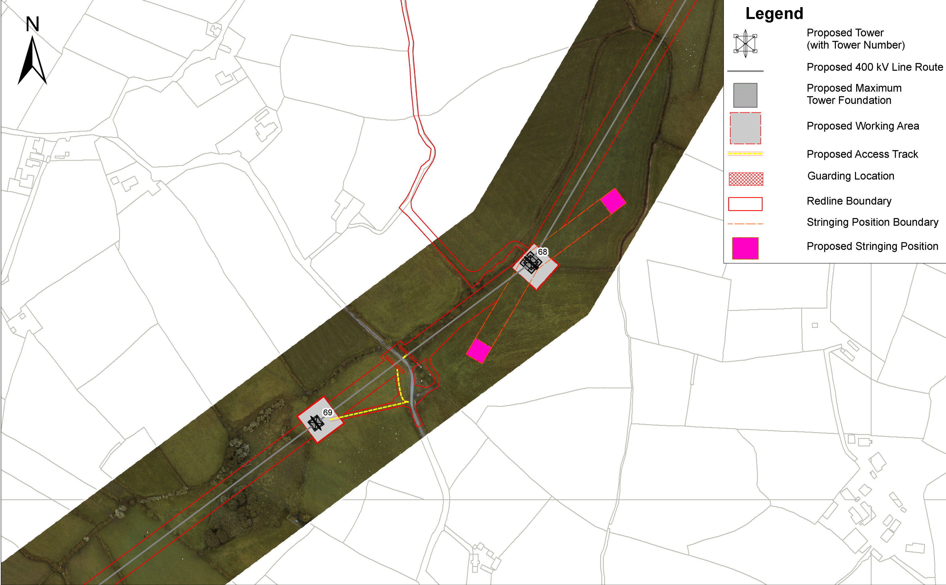
View 1: 1/2,500